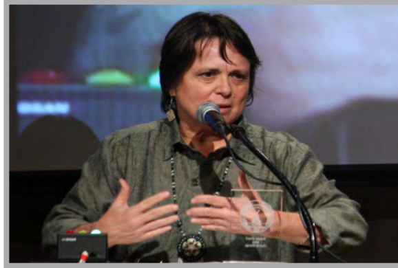
CHERRIE MORAGA, 2013 Pioneer Award Honoree