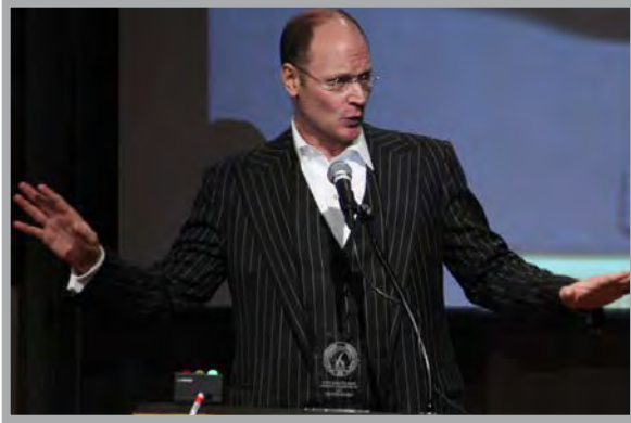
AUGUSTEN BURROUGHS, Trustee Award 2013