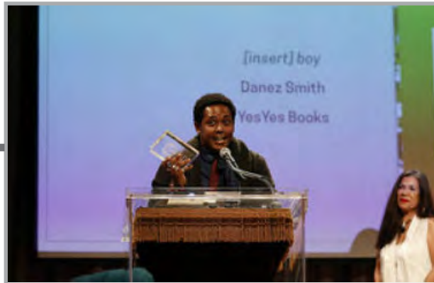
DANEZ SMITH, Lambda Literary Award-winner

Lambda Literary believes Lesbian, Gay, Bisexual, Transgender and Queer literature is fundamental to the preservation of our culture, and that LGBTQ lives are affirmed when our stories are written, published and read. We are the world’s leading nonprofit organization that nurtures, celebrates and preserves LGBTQ literature through programs that honor excellence, promote visibility and encourage development of emerging writers.