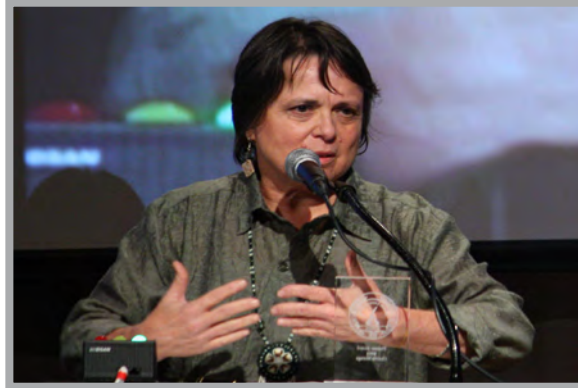
CHERRIE MORAGA, 2013 Pioneer Award Honoree